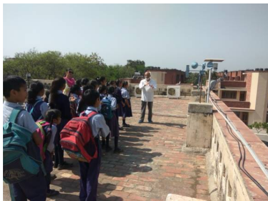
Anemometer and Sunshine Recorder