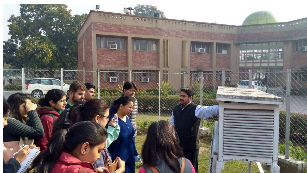
Visit of Students to IMD Chandigarh

Besides the above event, the Chapter members delivered lectures from time to time at various scientific institutions, schools and prominent public places. Different schools in the Tri-City were invited to IMD, Chandigarh to explain the functioning of IMD and importance of weather as part of outreach programme. Steps have been taken to popularize weather and climate science in this part of the country.