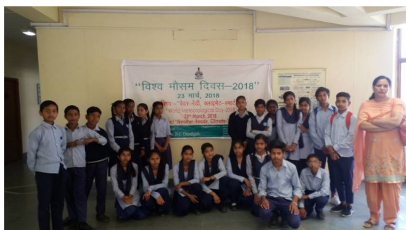
Students in MC Chandigarh

Besides the above event, the Chapter members delivered lectures from time to time at various scientific institutions, schools and prominent public places. Different schools in the Tri-City were invited to IMD, Chandigarh to explain the functioning of IMD and importance of weather as part of outreach programme. Steps have been taken to popularize weather and climate science in this part of the country.