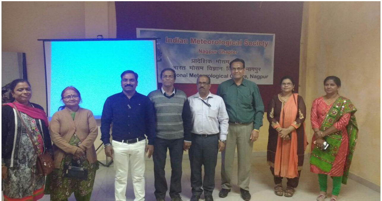
During lecture Brain Memory Protein and technique stress managements