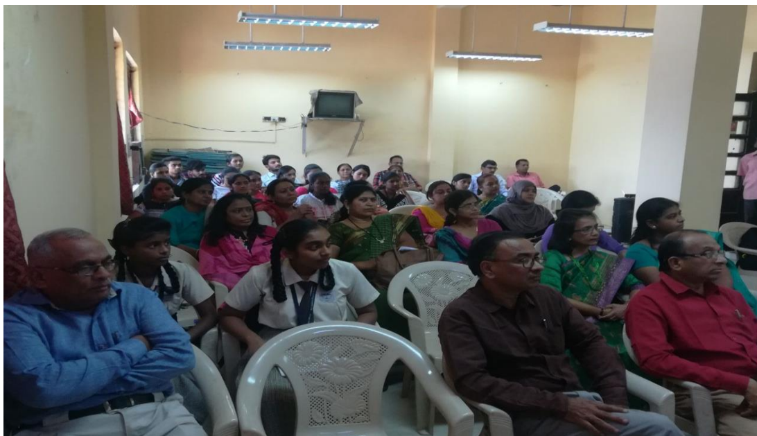
Members, IMS members and official of RMC as audience