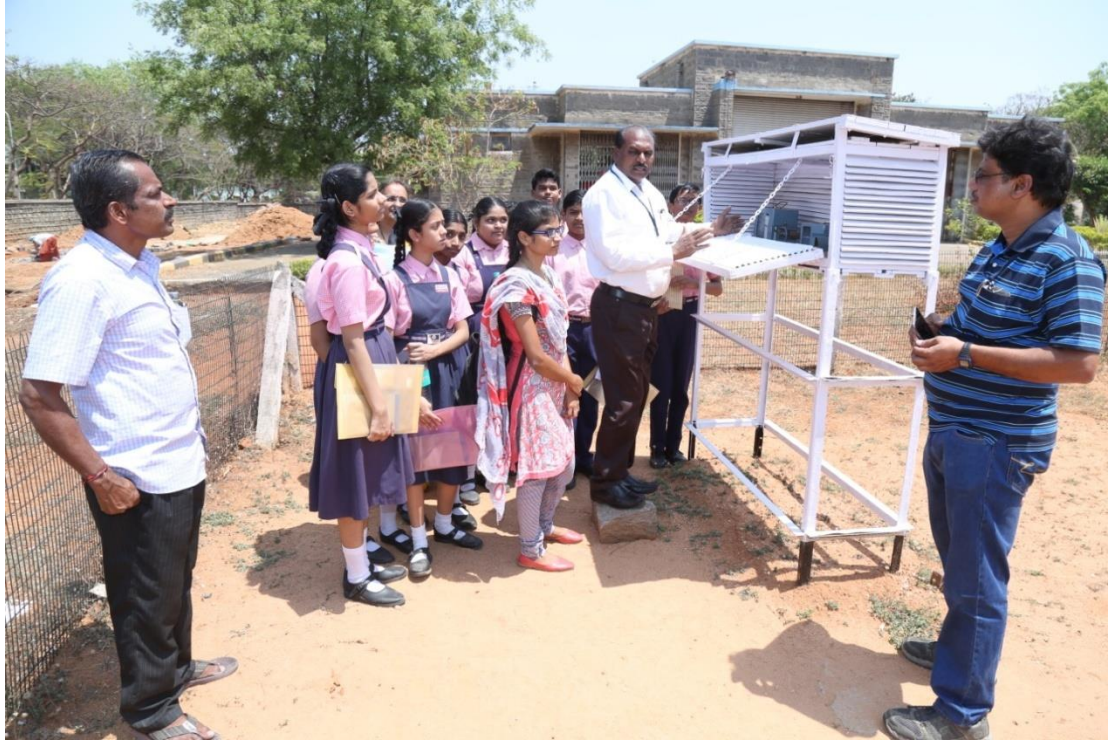
8. Visit to the Exhibition arranged at First floor of Radar Building.