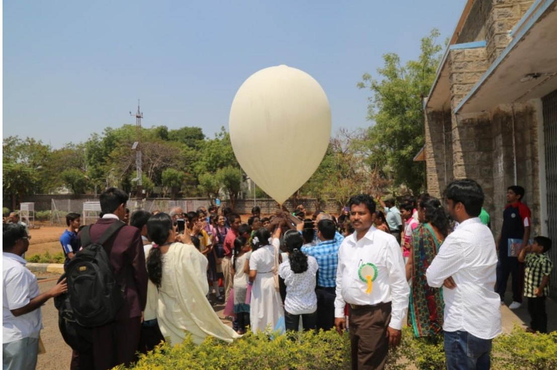
7. Visit to the Observatory by the Students